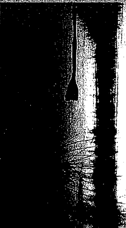
Tidal Marsh Restoration